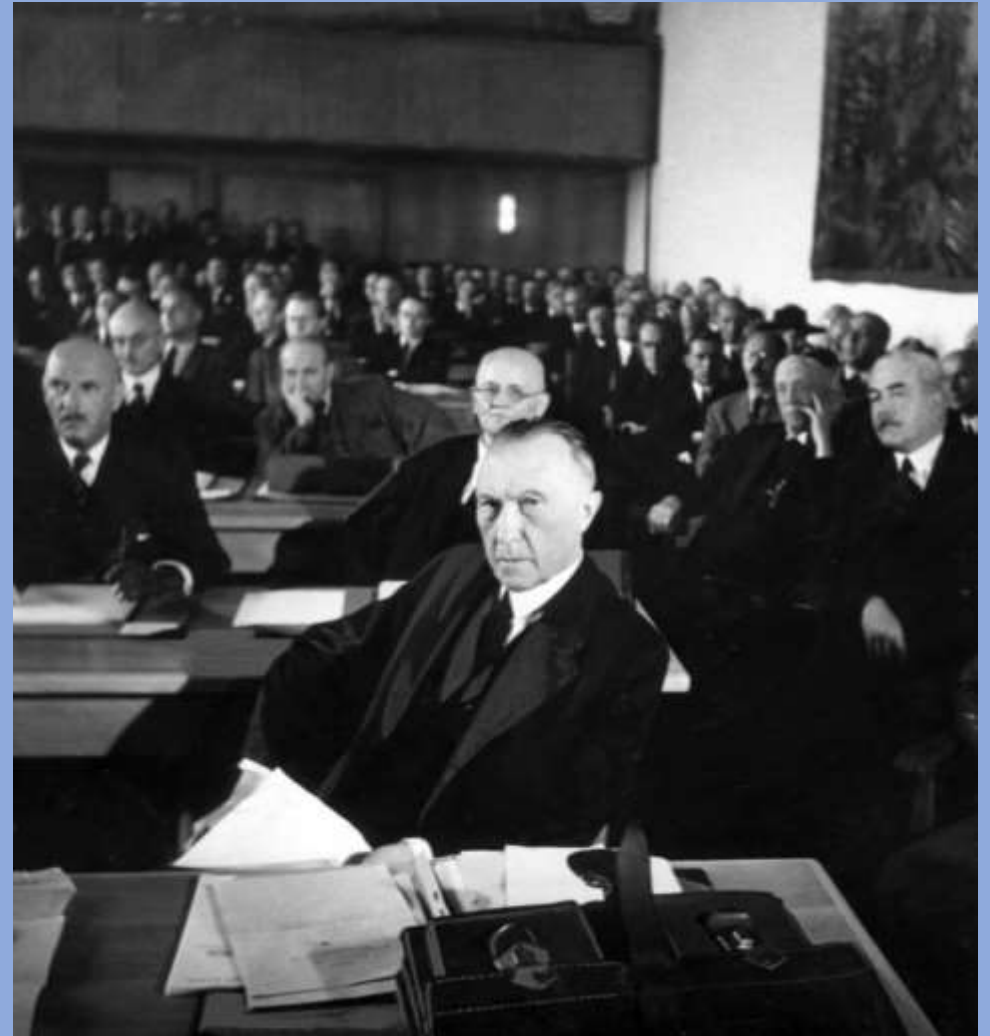
Konrad Adenauer at the Hague Congress

https://www.cvce.eu/en/obj/bericht_von_konrad_adenauer_uber_den_haager_kongress_koln_21_mai_1948-de-1e9d5dab-981b-4853-b6f6-26a4ef8117c2.html