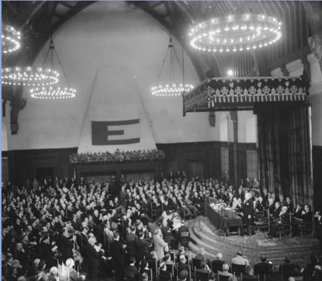
Meeting in the Hall of Knights in The Hague

Only 3 years after the Second World War, the (West)German participants were for the first time equally involved in a European conference.